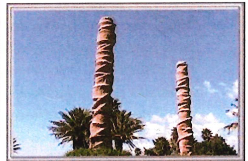
Asherah Poles →

25 That night the LORD said to him, "Take your father's bull, and the second bull seven years old, and pull down the altar of Baal that your father has, and cut down the Asherah that is beside it 26 and build an altar to the LORD your God on the top of the stronghold here, with stones laid in due order. Then take the second bull and offer it as a burnt offering with the wood of the Asherah that you shall cut down." 27 So Gideon took ten men of his servants and did as the LORD had told him. But because he was too afraid of his family and the men of the town to do it by day, he did it by night.