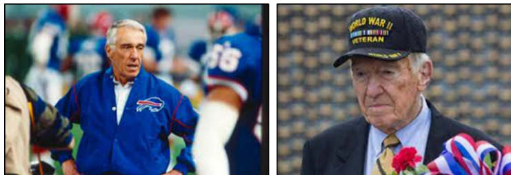
Marv Levy – Former Buffalo Bills Head Coach

11 They found an Egyptian in the open country and brought him to David. And they gave him bread and he ate. They gave him water to drink, 12 and they gave him a piece of a cake of figs and two clusters of raisins. And when he had eaten, his spirit revived, for he had not eaten bread or drunk water for three days and three nights. 13 And David said to him, "To whom do you belong? And where are you from?" He said, "I am a young man of Egypt, servant to an Amalekite, and my master left me behind because I fell sick three days ago. 14 We had made a raid against the Negeb of the Cherethites and against that which belongs to Judah and against the Negeb of Caleb, and we burned Ziklag with fire." 15 And David said to him, "Will you take me down to this band?" And he said, "Swear to me by God that you will not kill me or deliver me into the hands of my master, and I will take you down to this band."