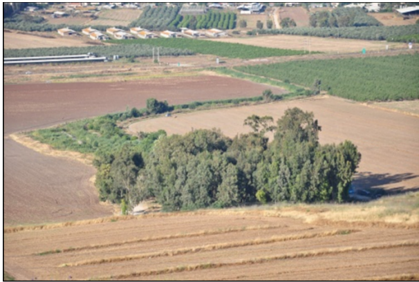
Spring of Jezreel