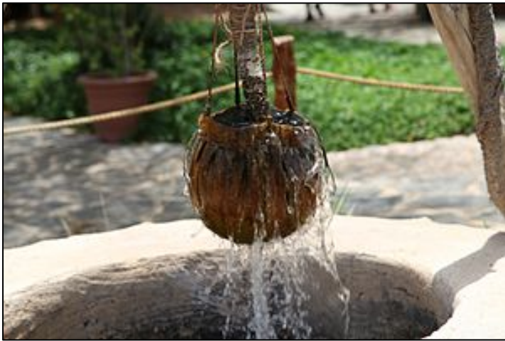
Leather water jar