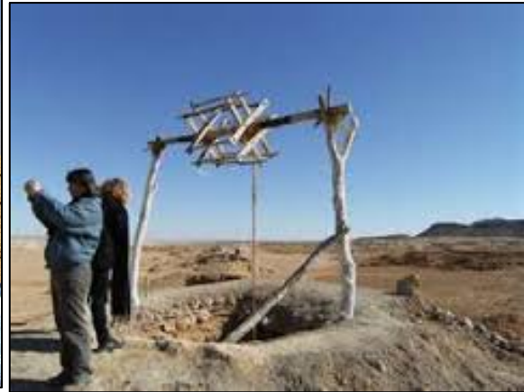
Modern-day pictures of the same kind of wells used in antiquity